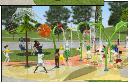
Photo of planned splash pad.

Located just off North Marietta Parkway at Allgood Road, Marietta's Elizabeth Porter Park is scheduled to be constructed in 2017. The park will feature a