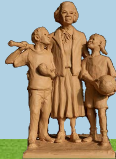
Left: Clay rendering of a proposed statue honoring Elizabeth Porter.