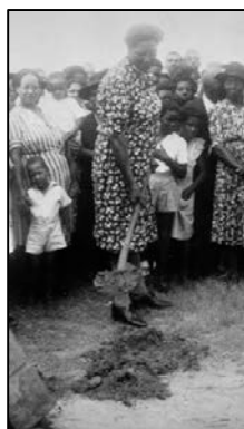
Photo from hospital ground breaking in 1946.

To ensure the preservation of this history, a committee of community members has worked since 2015 to design elements within the park that will depict the story of the site's history and significance.